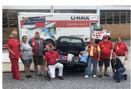
Blue Ridge Pound 319 of NC Pack also donated dog food to their local animal shelter.