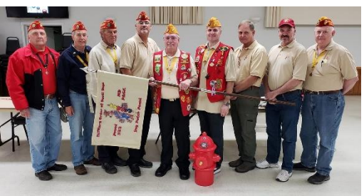
Dog Patch Pound 333 pose for a picture.