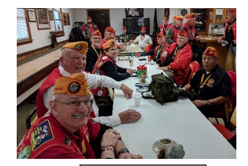
Members of the Missouri Pack