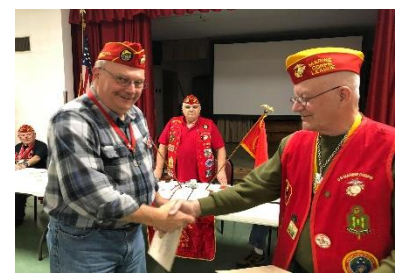
Devil Dog Show Me Pound 66 hands out awards for a dog gone good job.