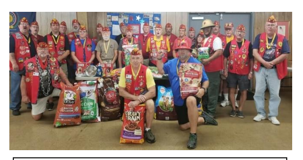
Dogs of Pound 210 NC Pack donate 411 pounds of dog food to the local animal shelter for canines affected by Hurricanes Florence & Michael